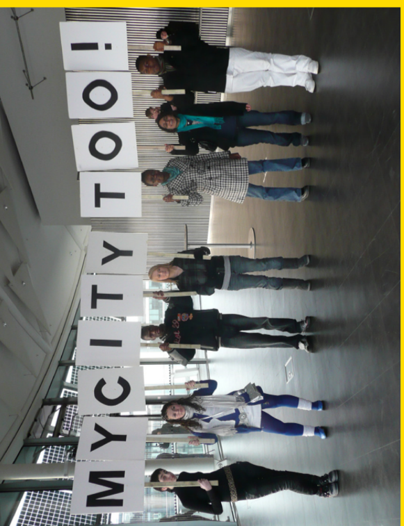
My City Too Ambassadors at City Hall, London